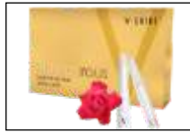
LIPSTICK & LIPGLOSS