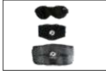
NECK GUARD, EYE PATCH & WAIST GUARD